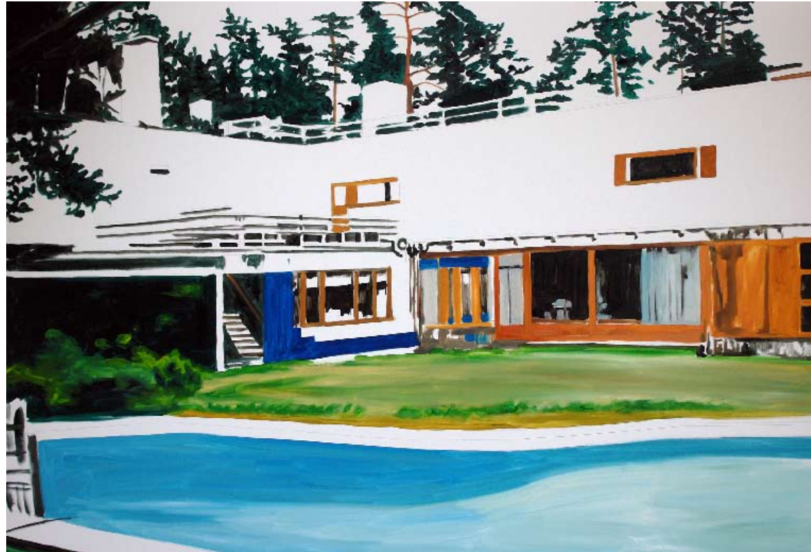
> Pool West View Morning (after Aalto) oil on canvas 47.2 x 59.1 inches (120 x 150cm)