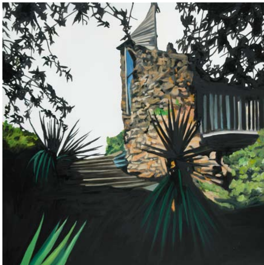
> Tower East View Midday oil on canvas 39.4 x 39.4 inches (100 x 100cm)