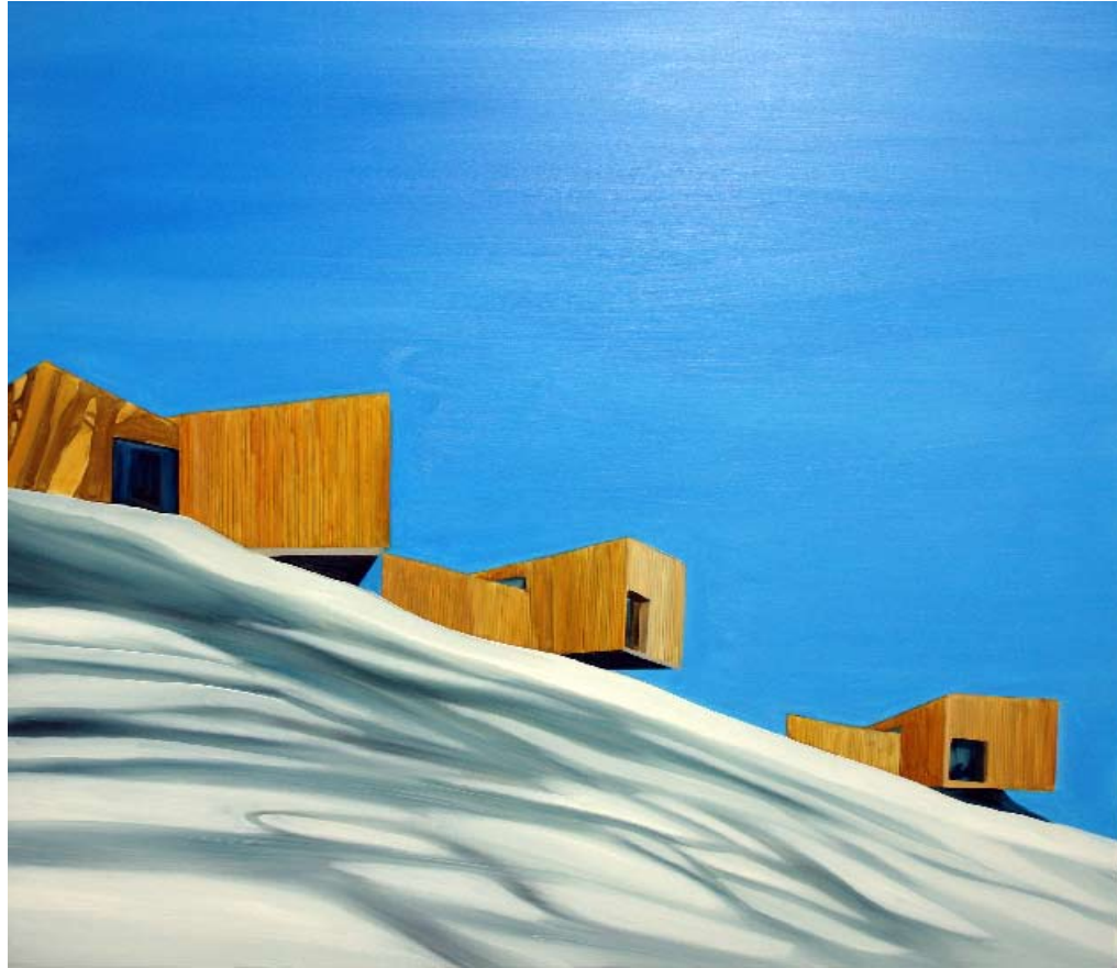
> Ideal Studio Complex III (after Bates Maher)